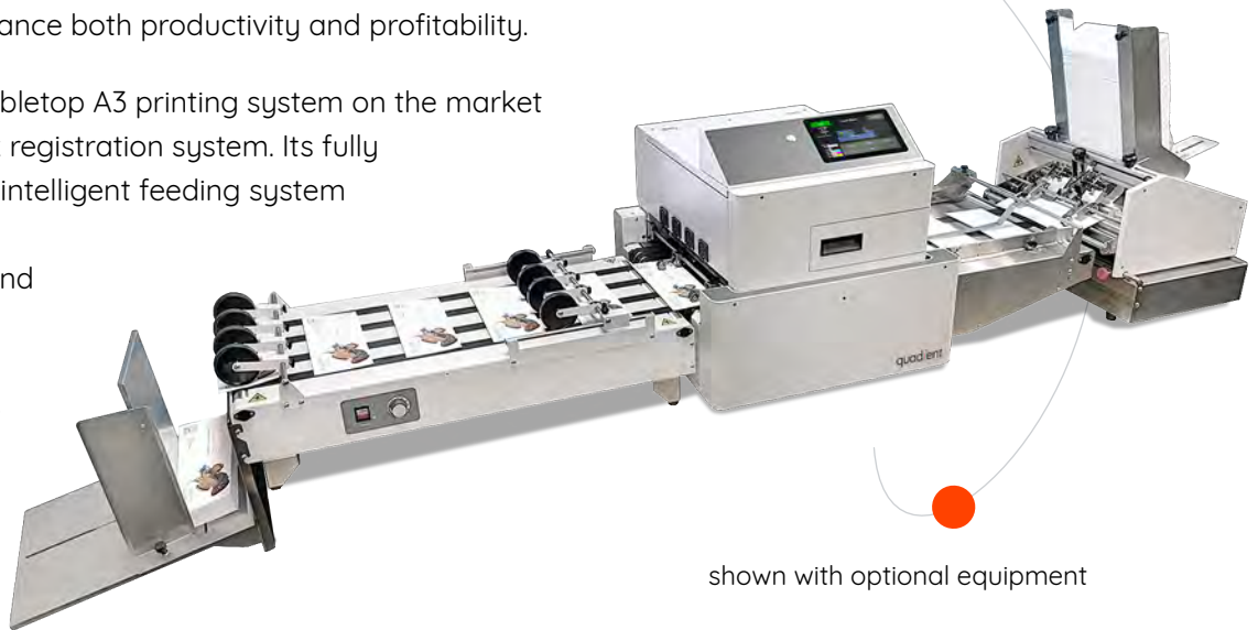
shown with optional equipment

The MACH 7 is the first tabletop A3 printing system on the market with our built-in AccuTrak registration system. Its fully synchronized and robust intelligent feeding system optimizes throughput, offering precise control and simplifying setup. Faster throughput and more affordable inks save time and money and increase profit on every job.