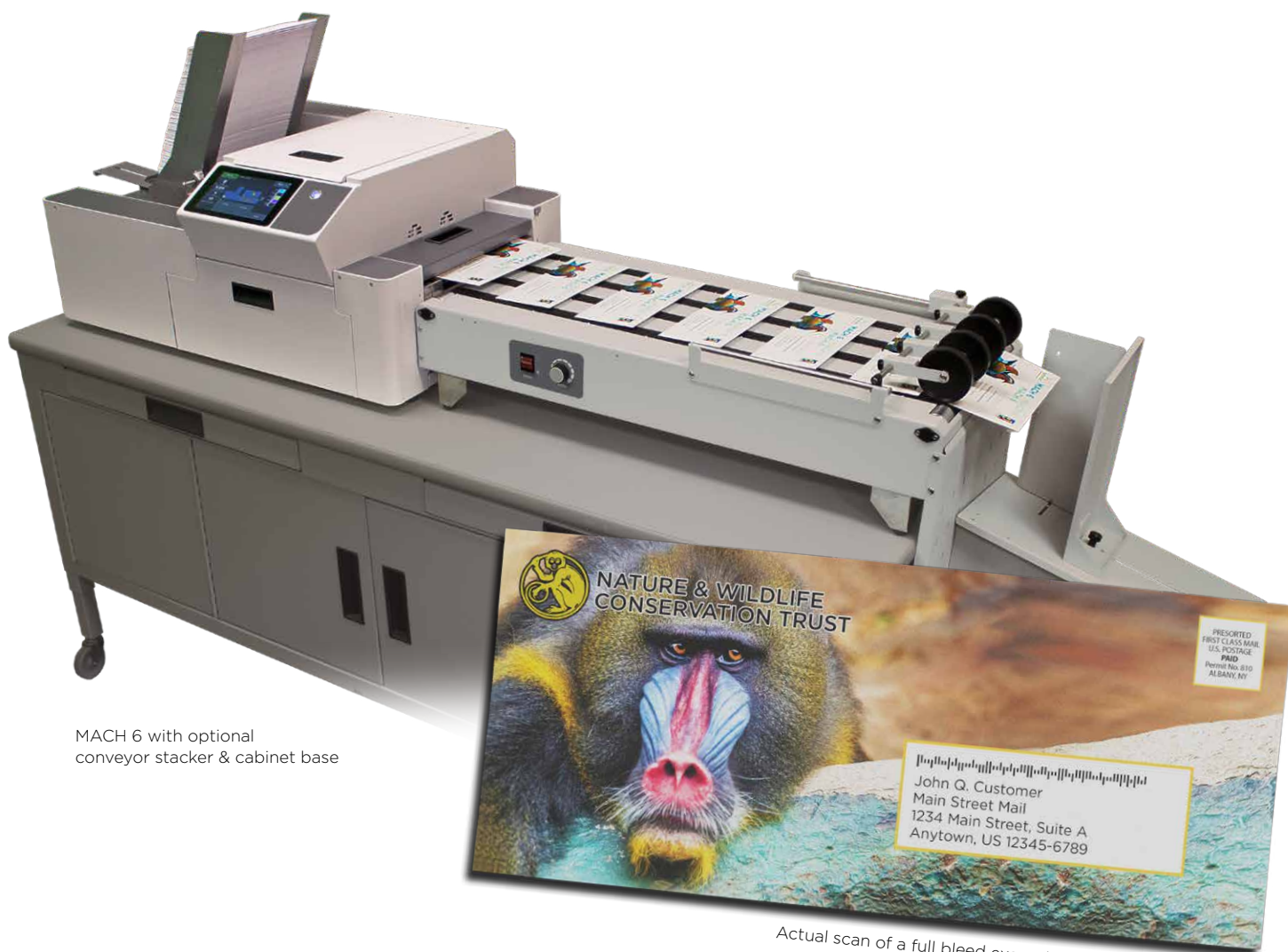
MACH 6 with optional conveyor stacker & cabinet base

Actual scan of a full bleed example printed on the MACH 6