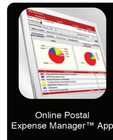
Online Postal Expense Manager™ App

The Neopost iMeter™ postage meter is an internet connected smart device that provides functionality beyond the traditional postage meter. The IS-330 and Neopost iMeter™ are connected online to help you better manage your mailing operations and control costs. Low ink email alerts keep you abreast of your ink usage and simplify ink cartridge reordering. With the IS-330, postal rate changes are hassle-free thanks to direct rate downloads, which ensure full postal compliance.